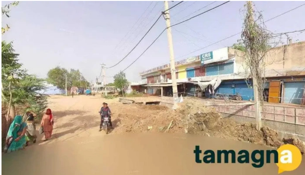
Crs infocom narnaul